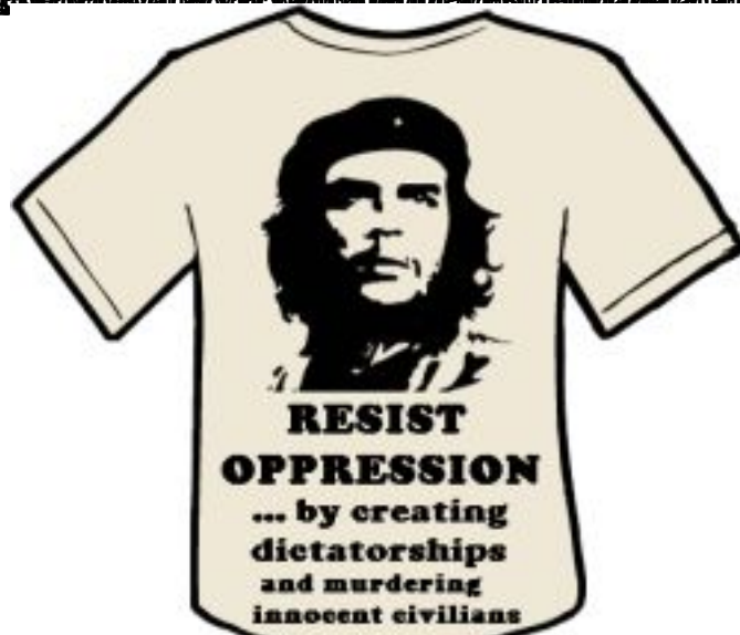
with the title of the book by Robert F. Kennedy (A true story of Che Guevara's life and death) Under