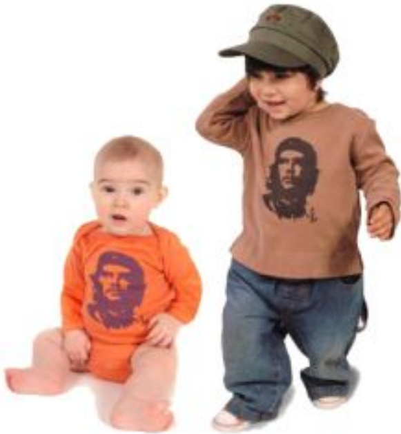
che guevara t-shirts for the @aiming as Boog of Records Ross made re under all Piche Mab Case Today,