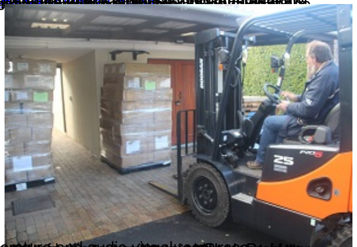
Support Kill & Love: A book that will help you understand the truth about the drug industry and the impact it has on our society. info@1000.org