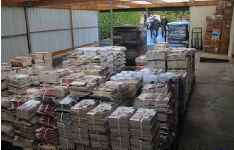
Support Kill & Love: A book that will help you understand the truth about the drug industry and the impact it has on our society. info@1000.org