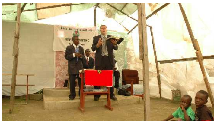
Preaching at the Sunday morning service of a new congregation in the midst of completing their building.

reserve, there were no fences. Throughout the night we could hear the lions roaring in the distance, and the hyenas in the nearby bush. During the day I had to continually battle the Tsetse flies, especially when I wore black – they seemed to like that color- a lot. Tsetse flies can leave a nasty bite, from which sleeping sickness