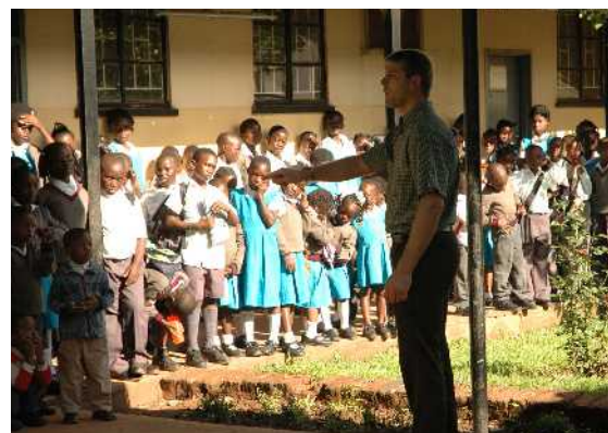
School Assembly at Excellence Christian Academy.