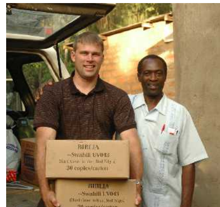
Delivering Swahili Bibles in Tanzania.

Keeping your commitments as a missionary isn't easy. There are so many factors that cause delays, necessitating prolonged exertion. This can lead to becoming tired and irritable, which is a very dangerous combination in the mission field. Most of what I do as a missionary rests on the relationships that I have with others, and the example that must be set through my attitude and activities. Stopping for prayer or reading God's Word is an absolute necessity to put things into perspective, and causes me to focus on the Lord, my only source of strength and vigor.