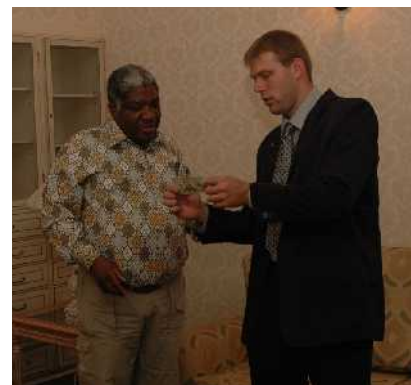
President Mwanawansa receives a "Million Dollar Question" tract.