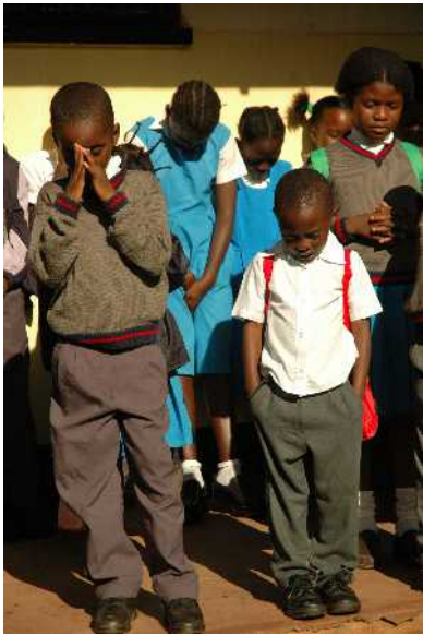
Excellence Christian Academy students preparing for the day.