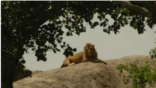
The king of the beasts surveys his domain.