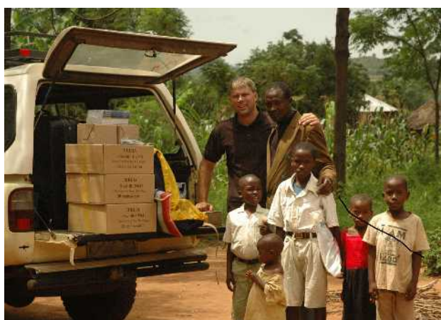
Delivering Bibles to a Pastor in Tanzania.

Later that week we drove another 3 long days to Tanzania. En route, we were able to purchase 100 Swahili Bibles to distribute to a rural community near the Serengeti plains. We stayed in a tented camp near Nata, located in the Gremetti Reserve. As it was a game