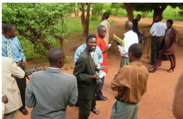
Zambian Pastors respond enthusiastically to an evangelism outreach in Chipata.

Their response afterwards was amazing. One pastor said, "We've never done anything like this before." While another responded, "Yes we did, back in 1996." "No," replied the other pastor, "your church might have, but as a group from different churches we haven't." It was obvious that the enthusiasm among them had sparked a new movement for evangelism in the community.